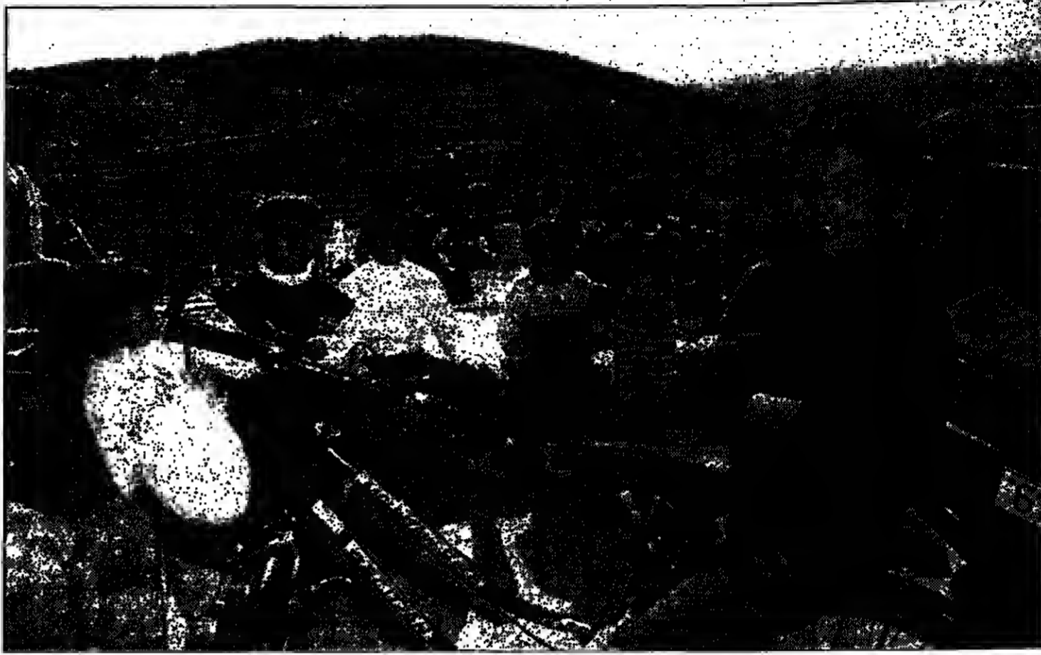
Children from Umm Tuba participate in a Peace Now demonstration yesterday, at a site overlooking Har Homa.

Reshef attacked Labor Party leaders who favor building the neighborhood, saying "I think it is another example of Labor's leadership nodding their head, and going along with a plan that is a mistake, only because what is